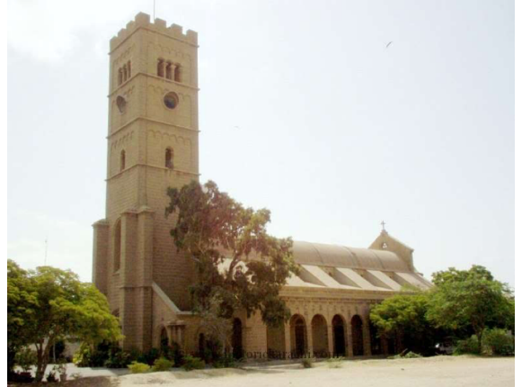
Holy Trinity Cathedral Karachi

He returned to New Zealand in 1972 and was appointed Assistant Bishop of Waikato and then of Auckland. He was made a Fellow of St John's College in 1973.