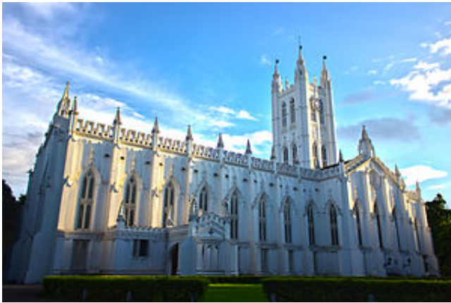
St Paul's Cathedral Kolkata