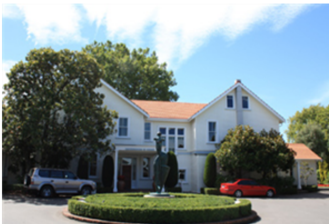
The Homestead building Lindisfarne College

He became a Presbyterian Minister. As a young man he led the Christian Order Campaign, a national movement of all non-Catholic Churches. He was one of the Churches representatives on the National Council of Churches and Convenor of the General Assembly’s Board of Education. He founded a children’s home and two old peoples’ homes and he was the Founder and first Rector of Lindisfarne College, Hastings.