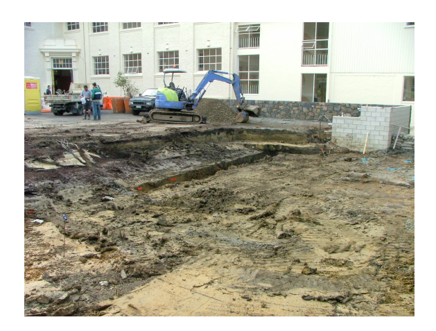
Progress work on the terracing and the first concrete is in. Also in this second, image new blockwork can be seen as can the completed stone wall.