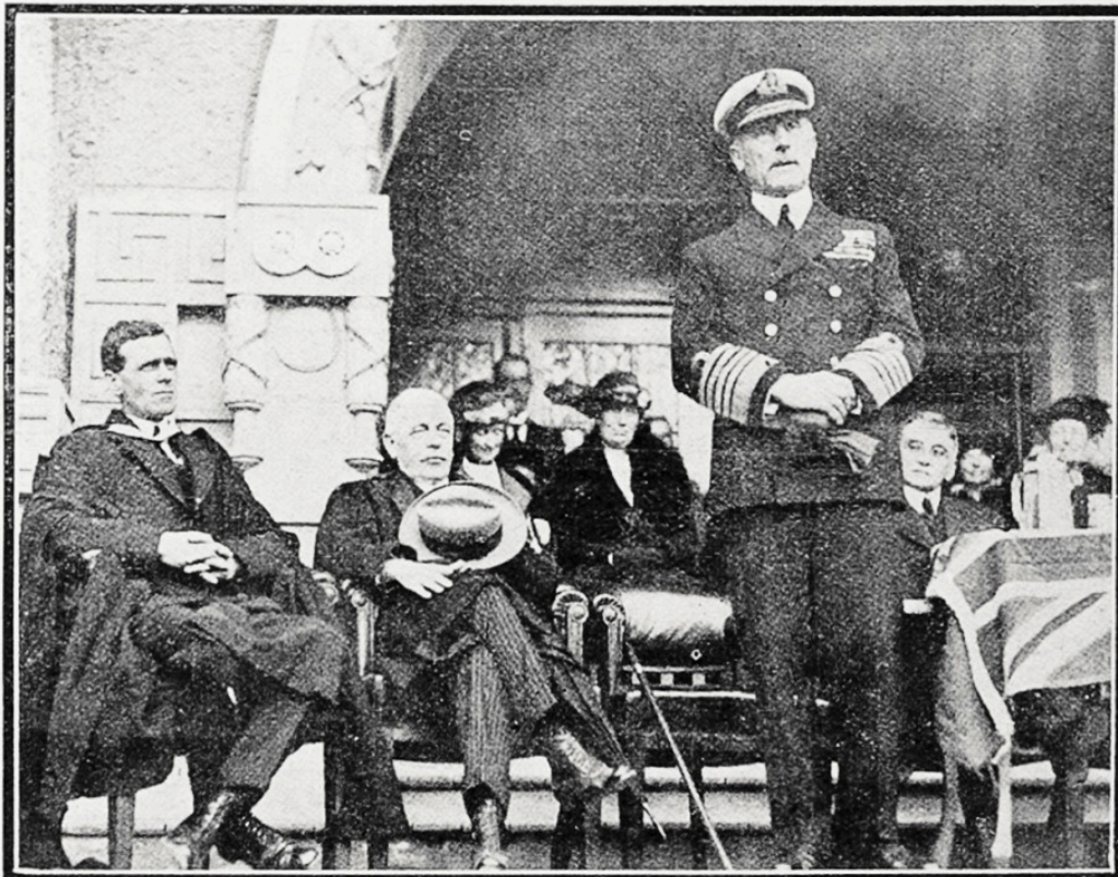
THE GOVERNOR-GENERAL, LORD JELlicOE FORMALLY OPENING THE MOUNT ALBERT GRAMMAR SCHOOL AT AUCKLAND LAST WEEK.

As we get closer to our Centenary in 2022, we warmly invite all Albertians to sign up to the database here to keep up to date with information, communications and events leading up to the Centenary celebration.