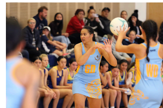
Netball Premiers v Epsom Girls Grammar