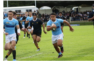
Rugby Boys 1st XV v Auckland Grammar