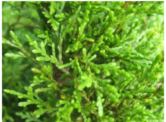
The second tree is an enormous rimu (Drachyiam cupressinum).

The following image is of its foliage, from Wikipedia.